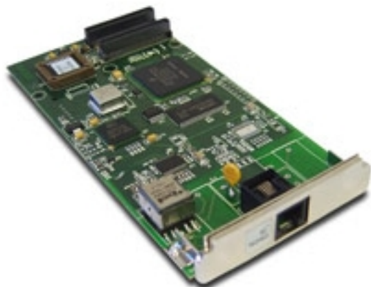
Fig. 1: PMC-2SHDSL Card

For further information on SHDSL technology, please see manual “Teldat-Dm742-I SHDSL”