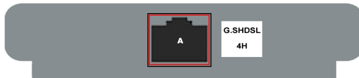
Fig. 2: Front of the PMC-2SHDSL Card

Figure 2 shows the front board of the PMC-2SHDSL card: